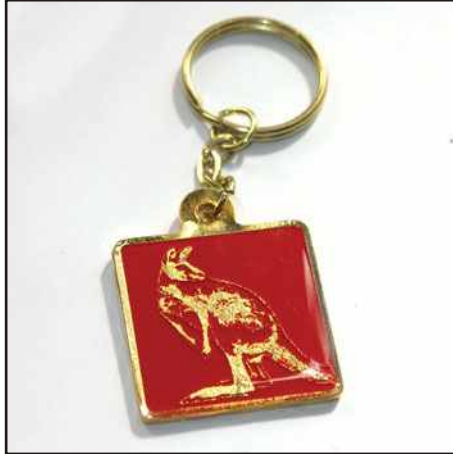
DieCast Soft Enamel